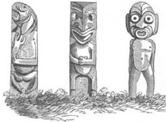
Na Rouni, or Monumental Effigies.